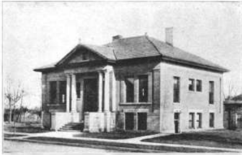
CARNEGIE LIBRARY, NEW HAMPTON

For more information on the history of the town, please visit the newly updated New Hampton Historical Society website at https://www.newhamptonhistory.org/