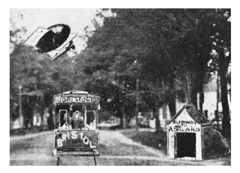
New Hampton, N. H., in the Future,

For more information on the history of the town, please visit the New Hampton Historical Society website at <a href="https://www.newhamptonhistory.org/">https://www.newhamptonhistory.org/</a>