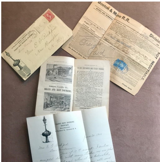
Spring 1900 Correspondence from Concord Foundry to the New Hampton W.C.T.U.

While the dog trough may be gone, it is good to know that our fountain was intended to serve pure water to New Hampton's horses, dogs and people! A big SHOUT OUT to the New Hampton Garden Club for ensuring that the fountain continues to give us all "great pleasure!"