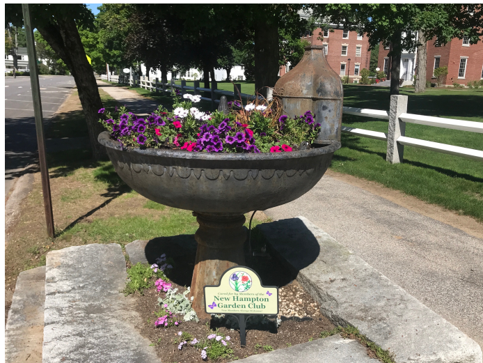
The Clapp's Fountain today thanks to the kind efforts of the New Hampton Garden Club

For more information on the history of the town, please visit the New Hampton Historical Society website at www.newhamptonhistory.org/