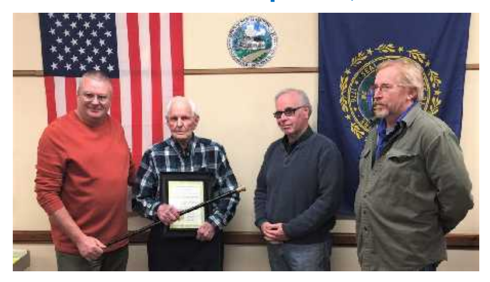
TOWN OF NEW HAMPTON, N.H.