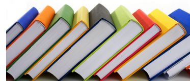
Friends of the Library Book Sale

COME TO OUR CHILDREN'S BOOK & MEDIA SALE NOV. 1ST - 4TH ALL SALES HELP SUPPORT OUR LIBRARY PROGRAMS :)