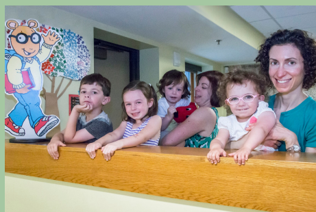
The Sinykin and Price Families