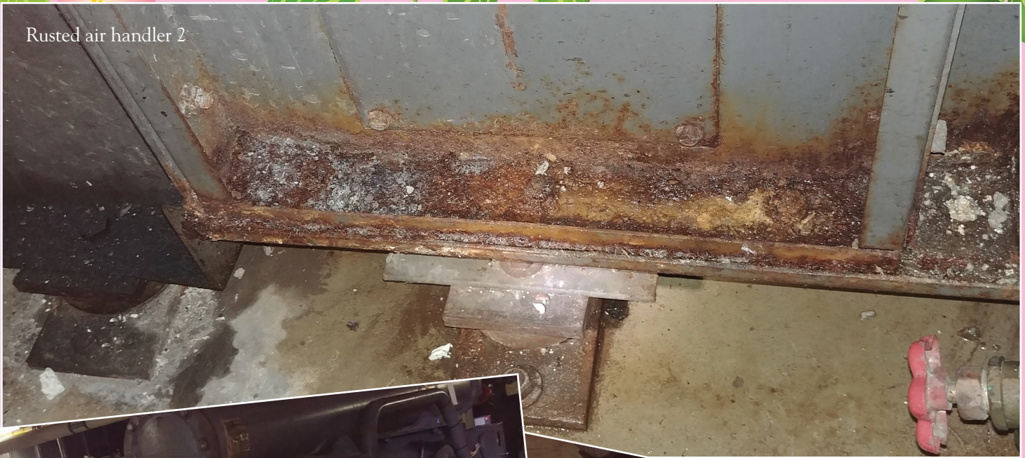
Leaking air handler with temporary repairs