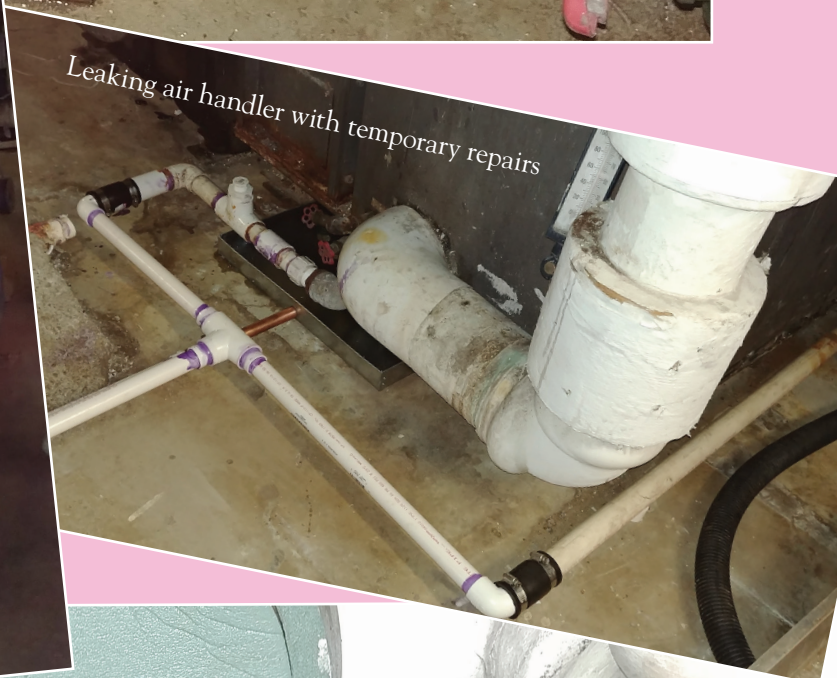
Leaking air handler with temporary repairs