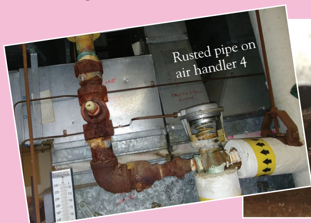
Rusted pipe on air handler 4

The Pearl River Public Library aims to provide the best possible service to the residents of the community, regardless of age, background, ability, or interest. Now is the time for the community to help shape how those services will be provided and what can be improved. Interestingly, going into the future, the space must be flexible enough for a dynamic staff to shape it to the community even as the residents demand more and more. Collections may move, the nature of programs may change, technology upgrades over time, and each of these shifts are an opportunity for the Library to provide better and better service to the community. Libraries in general are moving from a transactional facility (where patrons come, get books, and leave) to an experiential environment: stay, read in a comfortable space, study in quiet with digital and traditional resources, attend programs for your specific age group or area of interest, exercise your body as well as your mind, take out a collection of "things," and generally expand your horizons). The Library truly is becoming a path of many possibilities.