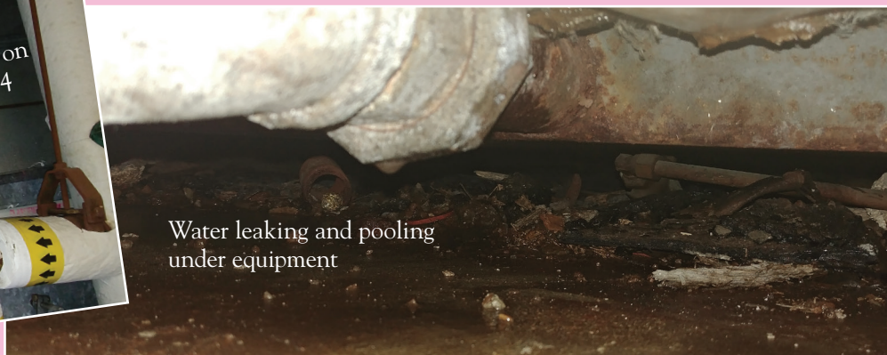
Water leaking and pooling under equipment