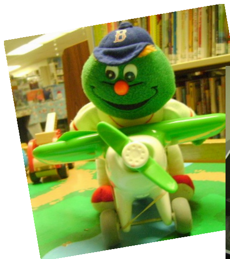
Some pictures from our Stuffed Animal Sleepover in February

We are pleased to announce that all of the yearbooks that the Library has copies of have been digitized and are available online. This project was done free of charge for us by the Internet Archive operating out of the Boston Public Library. You can access the yearbooks online through our website by clicking on the 'Reference and Research' tab and then clicking 'Sutton High School Yearbooks' on the left hand side. The direct link is: http://www.suttonpubliclibrary.org/sutton/yearbooks.asp . The yearbooks are listed by year and once you select one you have many options on how to view it and in what format. We are still looking for copies of certain years to borrow and have digitized. The estimated time we would need to borrow a yearbook would be 3 months. We are looking specifically for 1955 and earlier, 1980, 1982, 1985, 1987, 1988, 1989, 2006, 2008 and newer. We are, of course, glad to accept donations of any of these to add to the Library's permanent collection. We hope that you enjoy looking at the yearbooks as much as we do!