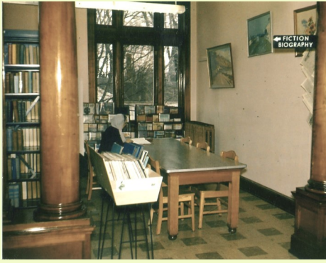
Quiet Reading Area