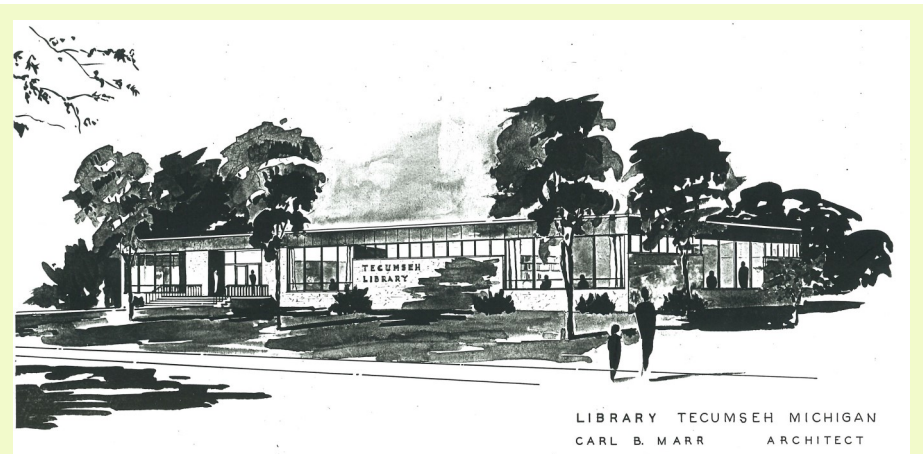
Architect's rendering of Tecumseh District Library's current building 1960

Our Library Board, our Friends group, our library staff and various directors, and our supportive patrons have each made substantial contributions to the legacy of Tecumseh District Library. It truly is a cornerstone of our community.