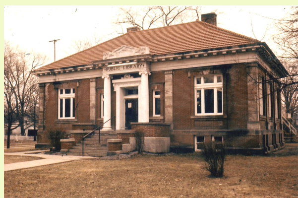
Tecumseh Public Library Carnegie Building 1960

In 1903, the School Board received funding from the Carnegie Foundation for a new library building to be built on Chicago Boulevard. This Carnegie Building was dedicated February 10, 1905 as Tecumseh's Public Library. The library shelves held 8,808 volumes. State aid was the library's major source of funding until a millage approved by voters in 1945 provided operating funds. Lenawee County received two more of the 5,000 Carnegie libraries built in the U.S. One was built in Adrian between 1907 and 1909, and the third was built of field stone in Hudson and is still being used as a library today.