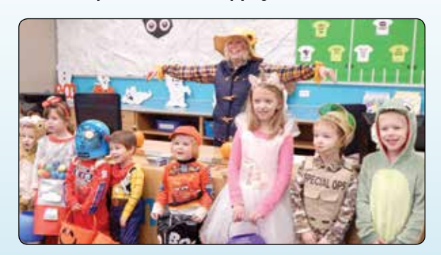
Photo Policy: Attendance at library programs and events constitutes consent to be photographed for White Lake Library publicity purposes.