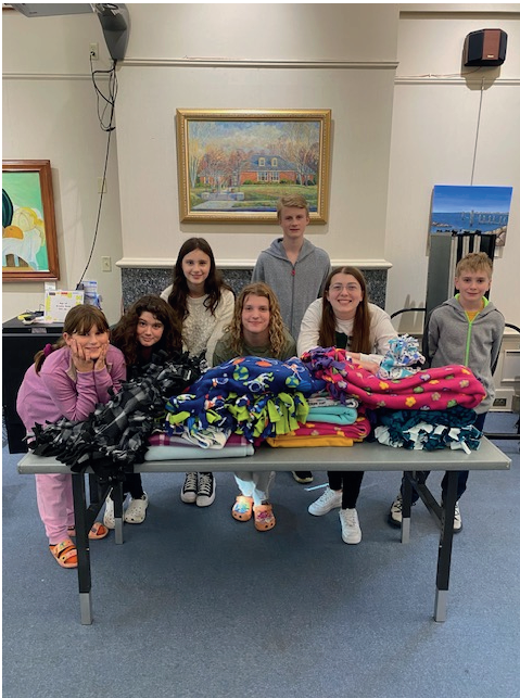
Members of TAB create fleece blankets.

In the spirit of community service, our Teen Advisory Board (TAB) has been busy making fleece hats for the library's Giving Tree, and fleece blankets for the Ronald McDonald House in Springfield, MA. Our next monthly meeting is Monday, Dec. 18 at 4:00 p.m. and we are always looking for new members.