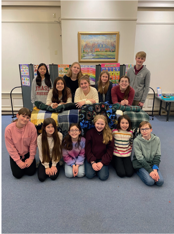
Teen Advisory Board (TAB) creates fleece blankets for Ronald McDonald House at their meeting on Nov. 18.